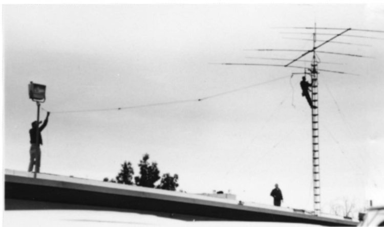
First, the 40 meter dipole is removed.