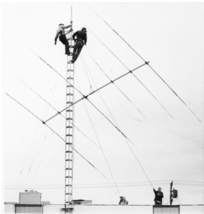
Finally, the Beam is slowly lowered.