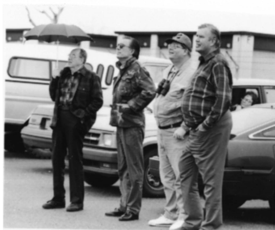
The peanut gallery "supervises."